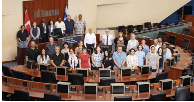
Planning priorities, City of Toronto