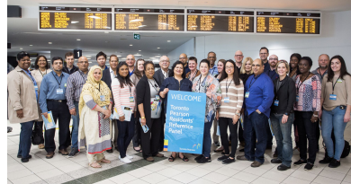
Noise management, Toronto Pearson