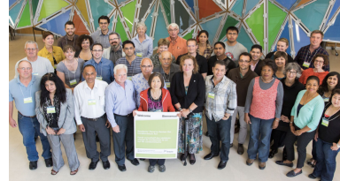
Condominium legislation, Government of Ontario