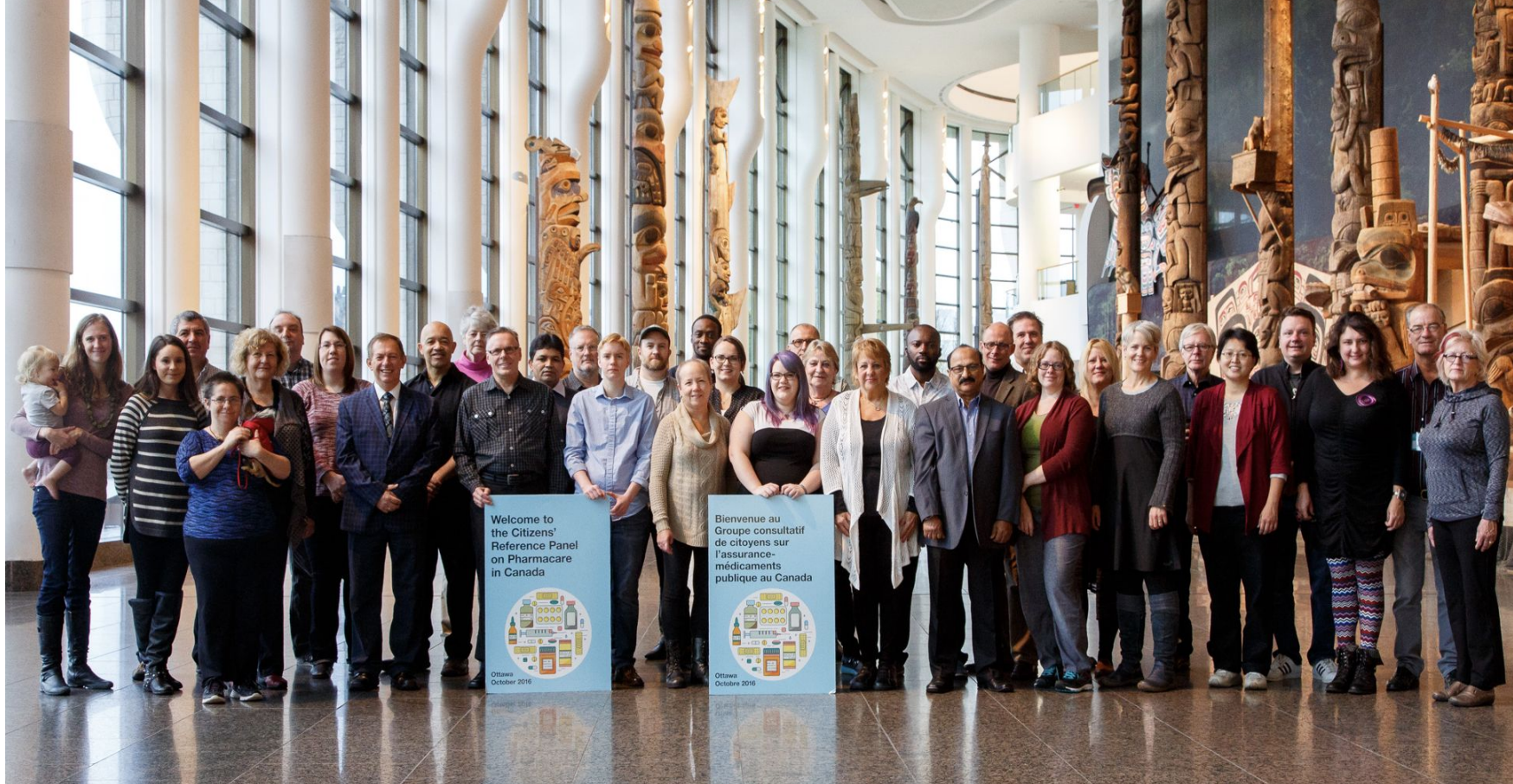
Citizens' Reference Panel on Pharmacare in Canada (2016)